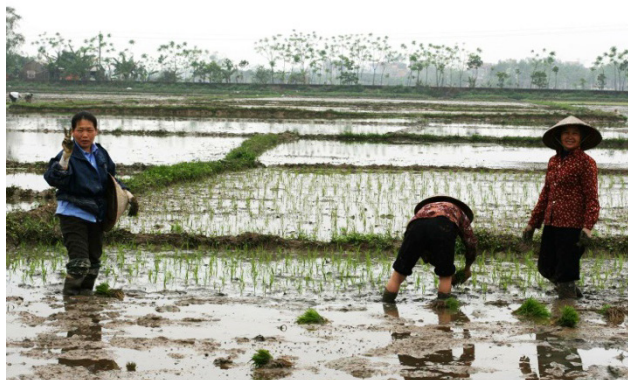
Figure 2. Rice crop cultivation in the Red River Delta